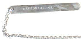
Hammer x 1