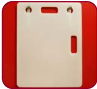
Cardiac board and brackets (MD-CARDBRD)