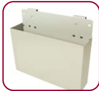
Chart Holder (CHARTHLDRDM)