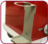
Oxygen tank holder (O2HLDR)