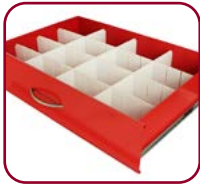
(2 Sets) Standard 6" Drawer Dividers (MD30-DIV6-S)