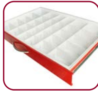
(1 Set) Standard 3" Drawer Tray Dividers (MD30-TRAYDIV3-S)