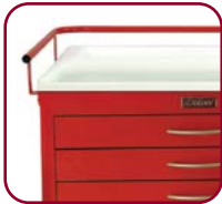
Toprail, matching cart color (MD30-TOPRAIL)