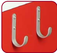
(2) Utility hooks (UHOOKS2)