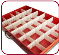
(1 Set) Standard 3" Drawer Dividers (MD30-DIV3-S)