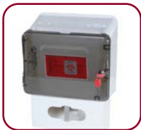
Locking Sharps Container (5qt) & Glove Box Holder (LKSHRPHOLD5Q-GLV)