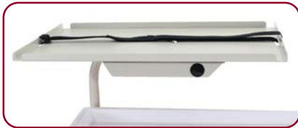
Defibrillator Shelf (MD-DEFIB)