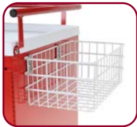
Large Utility Basket (BASKETDM)