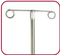
IV pole (MD-IV2)