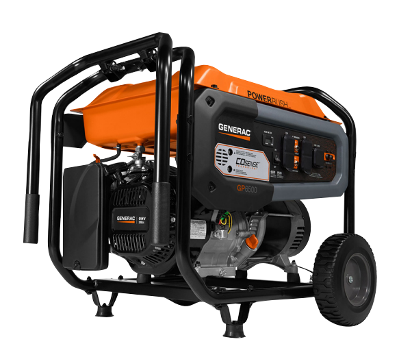
AC Rated Output Running Watts 6500 AC Maximum Output Starting Watts 8125