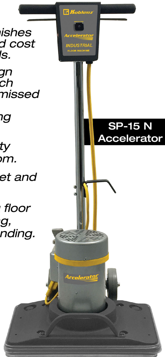
SP-15 N Accelerator