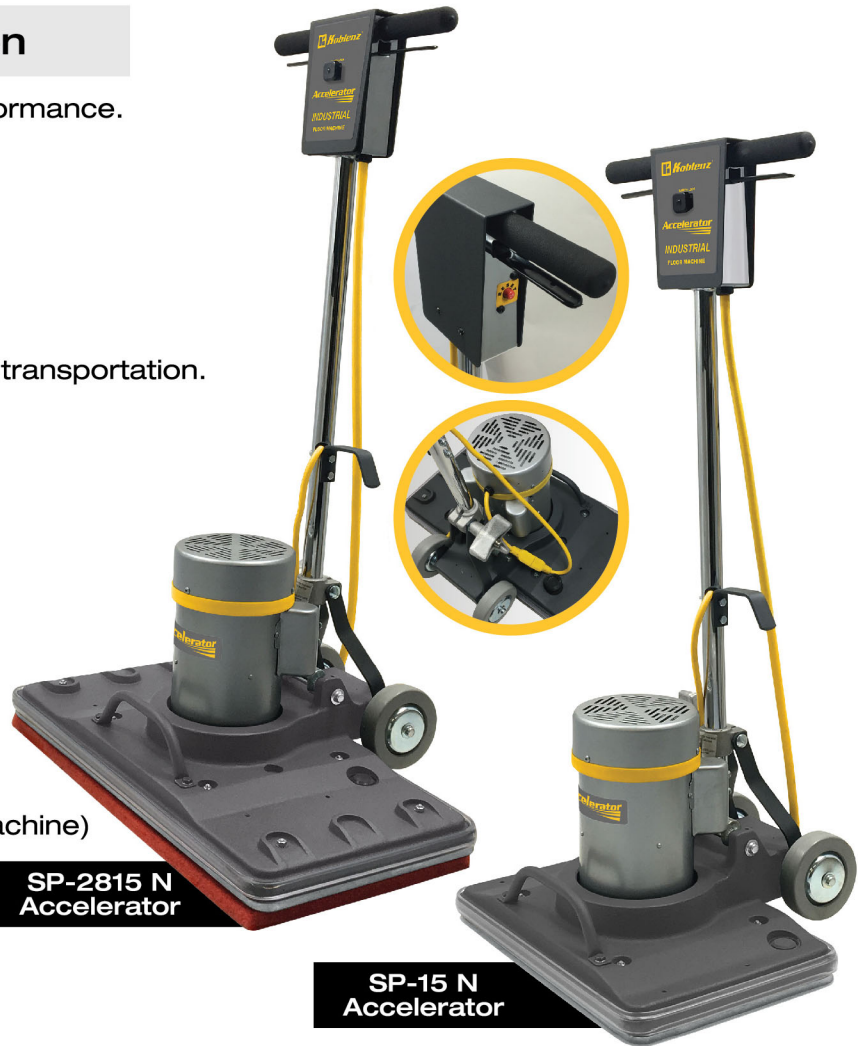
SP-2815 N Accelerator