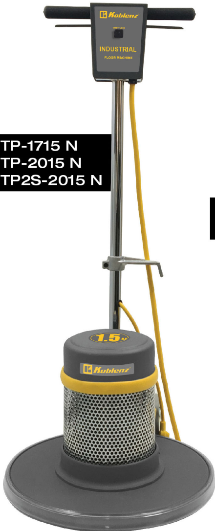
TP-1715 N TP-2015 N TP2S-2015 N