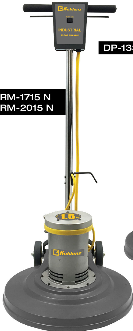
RM-1715 N RM-2015 N