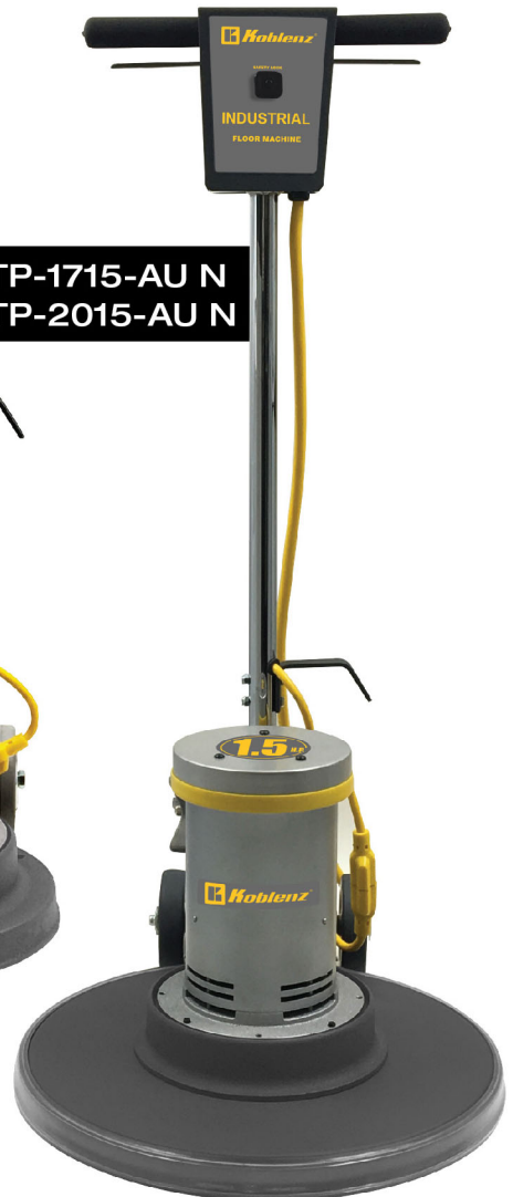
TP-1715-AU N TP-2015-AU N