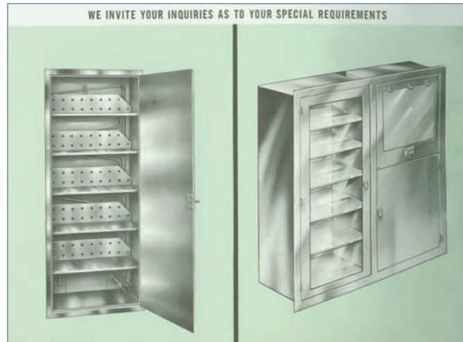
Blickman warming cabinet circa 1947.

The Blickman difference continues with its self-closing, adjustable tension, magnetic-gasket doors. Unlike with cumbersome, “meat-locker” handles on competing models, Blickman warming cabinets allow for convenient, hands-free operation. If your arms are full of bottles or blankets, you can simply open the door with your elbow—a time-saver for busy surgical staff—and the door will slowly swing shut on its own.