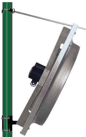
In-line Column Mount