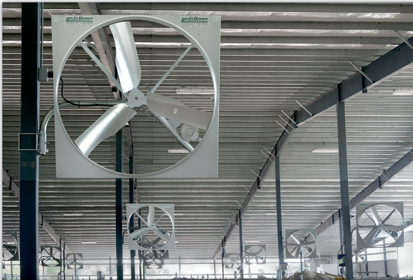
Belt Drive Panel Fans with Galvanized Prop and VRSBRSQ6X Swivel Offset 6" Square Column Mounting Brackets