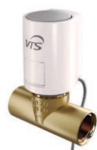
Valve with actuator