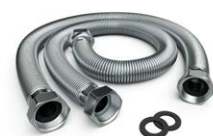
Flex. connecting hoses (set)