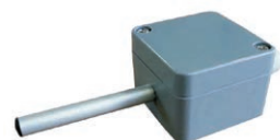
Room NTC sensor (for the VOLCANO controller)