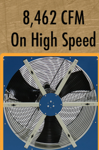
8,462 CFM On High Speed