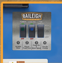
3 Speed Motor