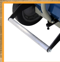
Foot Operated Brake