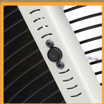
9 Atomizing Nozzles