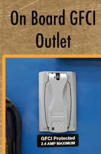
On Board GFCI Outlet