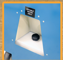
19 Gallon Water Tank

For more information visit www.BAILEIGH.com or call 920-684-4990