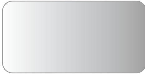
Acrylic Back Panel

PLEASE NOTE: Quantity of free standing feet (A) will vary depending on the size of the acrylic back panel (B).