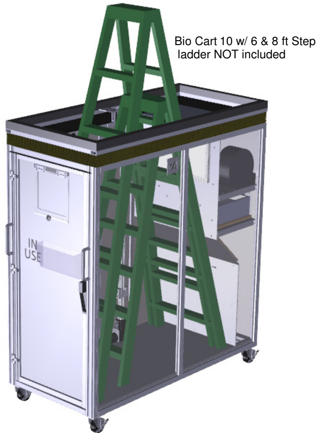
Bio Cart 10 w/ 6 & 8 ft Step ladder NOT included

Bio Cart HEPA 10, 120 Volt P/N FG0185 Rev A