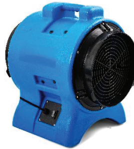
293036 12" Confined Space Vent Fan Rotomold Plastic, 2700 CFM, 1 HP