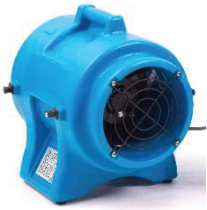
293034 8" Confined Space Vent Fan Rotomold Plastic, 1000 CFM, 1/3 HP