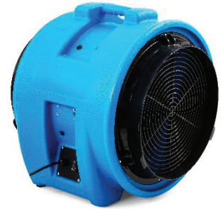
293037 16" Confined Space Vent Fan Rotomold Plastic 4000 CFM, 1 HP