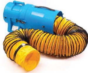
293035 8" Confined Space Vent Fan w/ Rotomold Plastic Canister & 25' Duct, 1000 CFM