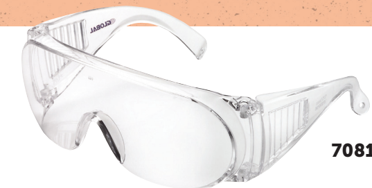
708121HC OR 708400

The VISTSPEC series visitor spectacles provide an over-the-glass economical solution for visitor or short-term site visits. Durable polycarbonate lens is available in an uncoated (708400) or scratch-resistant hard coat variation. (708121HC).