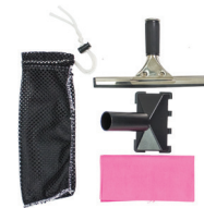
Mesh bag to carry mirror squeegee, microfiber cloth and other tools