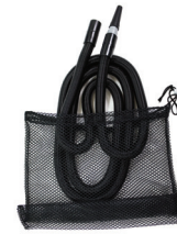
45' stretch exhaust hose with cuff, QuickDri tool and mesh carrying bag