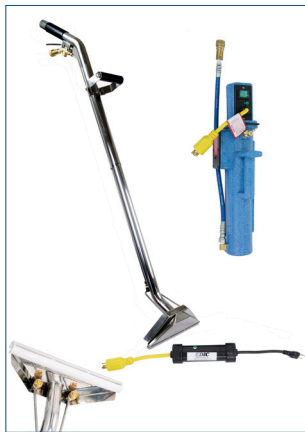
Part #: B2305417