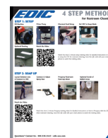
Laminated operation line card to mount on machine or on wall