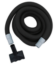
45' vacuum hose with gulper tool