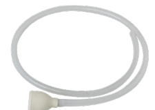
Sink fill adapter hose kit