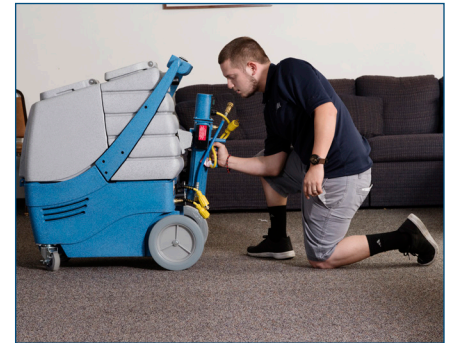
Heat 'N' Run External Heater B2305459